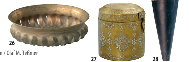
28. Bituminous (black) limestone vessel with inlaid decorations, Uruk, end of the 4 th millennium BC, H 22.5 cm.