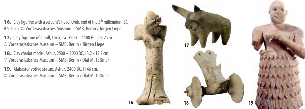
16. Clay figurine with a serpent's head, Uruk, end of the 5 th millennium BC, H 9.6 cm.

Classical Antiquity: Figures wearing trousers or long robes (caftans) and jewellery. May have inscribed bases.