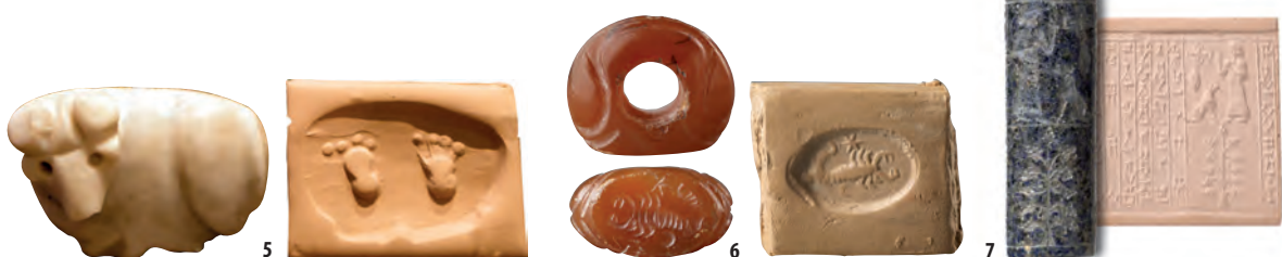
5. Banded calcite ram-shaped stamp seal, Tell Agrab, Uruk Period (ca. 4000 – 3100 BC).

Cylinder seals: May have cuneiform inscriptions. Size: 2-7 x Ø 1-3 cm. [7]