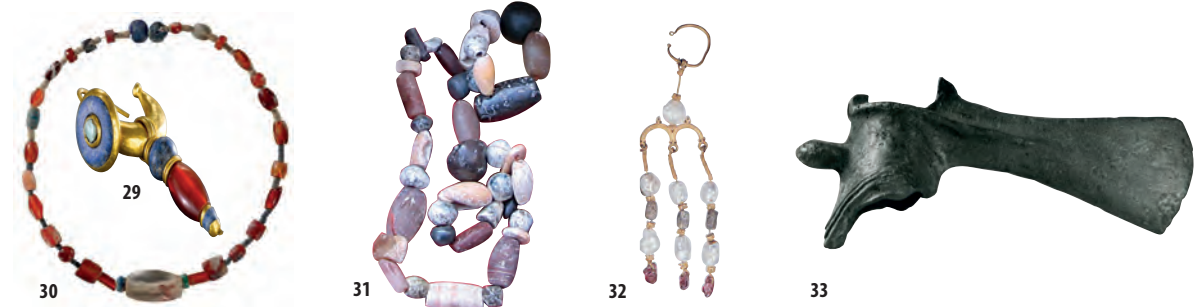
29. Gold earring with jasper and carnelian beads, Ashur, 14 th – 13 th c. BC, L 3.5 cm.

Tools and weapons: Ivory, stone and metal (copper, bronze, iron, steel) needles, axes, knives, arrows, armour, etc. Plain or with carved images (humans, animals, hybrids and/or deities). Armour and weapons of the Islamic period can be decorated with arabesques and inscriptions. [33]