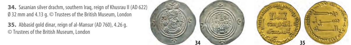
34. Sasanian silver drachm, southern Iraq, reign of Khusrau II (AD 622) Ø 32 mm and 4.13 g.

Islamic: Mostly Abbasid Caliphate gold dinars. With 2-3 lines in Arabic surrounded by inscriptions, or with an image on one side and writing on the other. Mint locations written in Arabic. Average size: Ø 19 mm. [35]