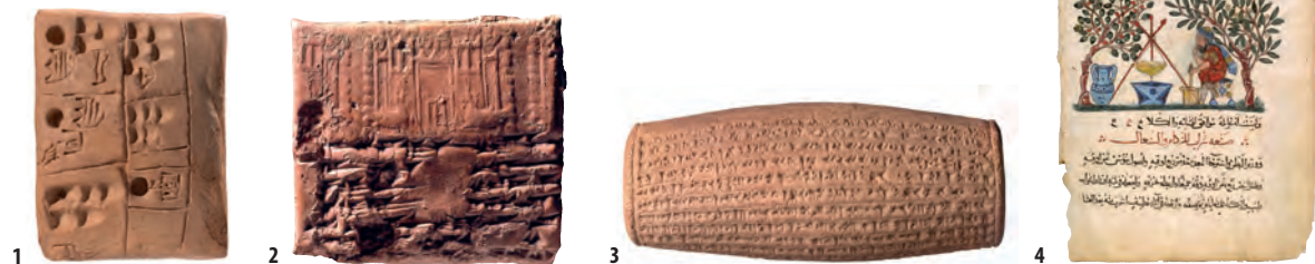
1. Clay tablet with cuneiform writing, Uruk, ca. 3200 BC, 5.7 x 4.3 cm.

Manuscripts, books and documents: Codices, Qur'ans and scientific texts. Paper or parchment, with Aramaic and/or Arabic inscriptions. Often with illuminations. [4]