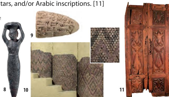
11. Carved teak doors, 9 th c. AD, 221 x 104.8 cm.