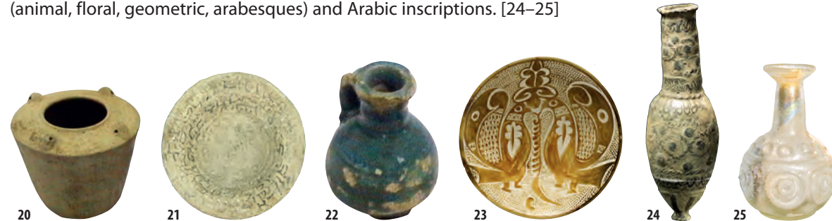
20. Pottery jar, southern Iraq, early 2 nd millennium BC, H 8 cm.

Glass: Jars, miniature bottles, etc. May be coloured and iridescent and/or have moulded or relief motifs (animal, floral, geometric, arabesques) and Arabic inscriptions. [24–25]